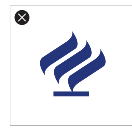
Do not use the flame alone.