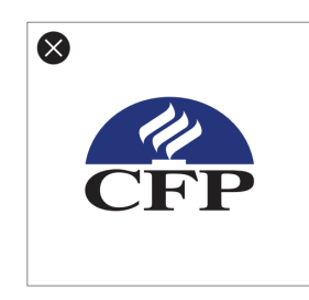
Do not use without the registered "®" mark.

3. Under no circumstances may the logo mark be altered, modified or, hand drawn, nor may it be typeset, reproduced or electronically scanned in poor quality so as to distort or significantly alter its appearance.