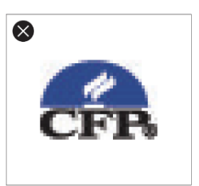
Do not use poor quality reproduction art.